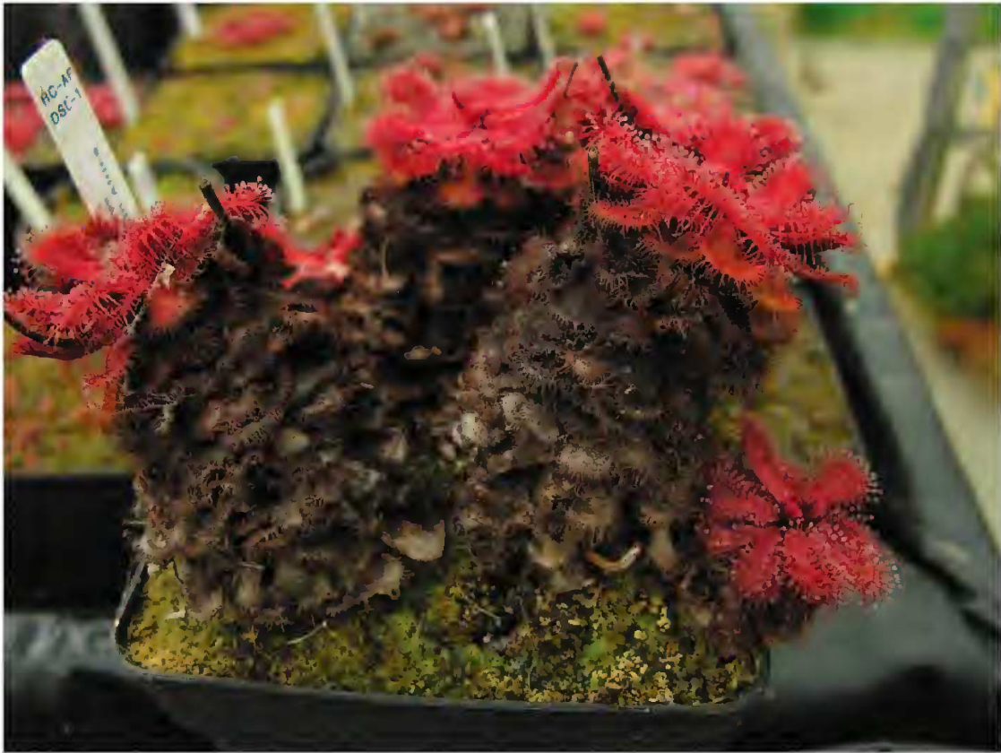
Figure 2: Old pedestal forming rosettes.

growing season, with the result that the plants have thrived, with none of the reduction in rosette size previously seen. In the wild of course, the natural rainfall will have the same effect.